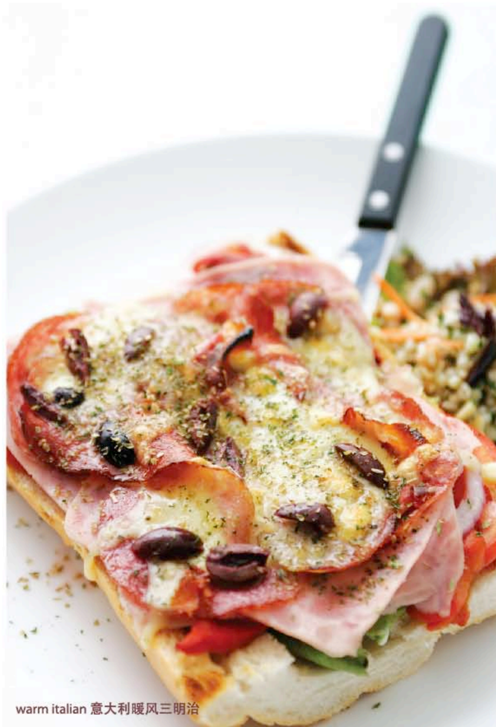
warm italian 意大利暖风三明治

extra big portions of ham and smoked chicken breast with swiss and cheddar cheeses, lettuce, tomato, onion, jalapenos, pickles, mayonnaise, american mustard, and vinegar all served on baguette 上等的烟熏鸡胸片、火腿片、瑞士芝士、美国车达芝士、生菜、番茄、酸黄瓜、墨西哥腌辣椒、洋葱，配上蛋黄酱、美国芥末酱、橄榄油和意大利红酒香醋一起夹在法式长棍面包里 72