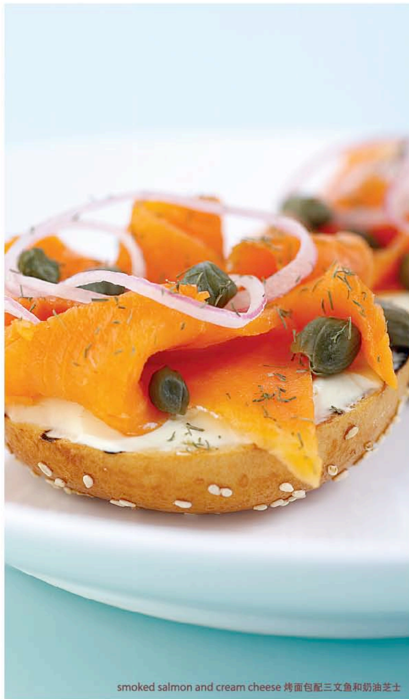
smoked salmon and cream cheese 烤面包配三文鱼和奶油芝士