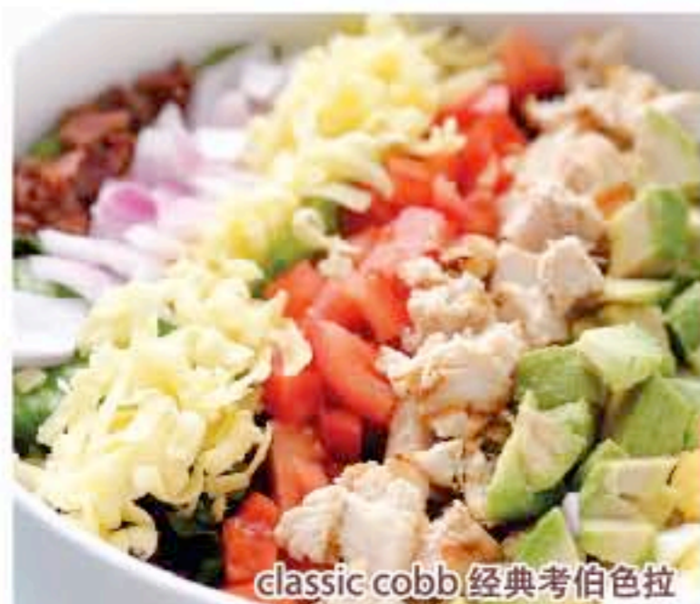
classic cobb 经典考伯色拉

grilled chicken breast, bleu cheese, olives, walnuts, onion, red and yellow peppers, and sun-dried tomatoes. with dijon vinaigrette 美味多汁的烤鸡胸配上蓝波芝士，橄榄、核桃、红黄双色甜椒、洋葱以及进口的番茄干并佐以法式芥末香醋汁 75