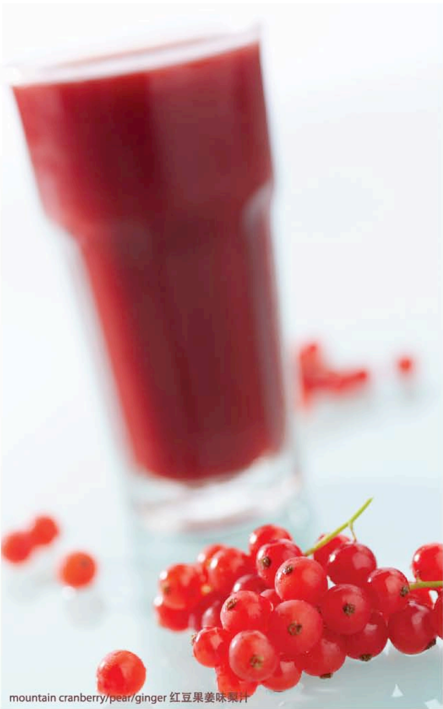
mountain cranberry/pear/ginger 红豆果姜味梨汁