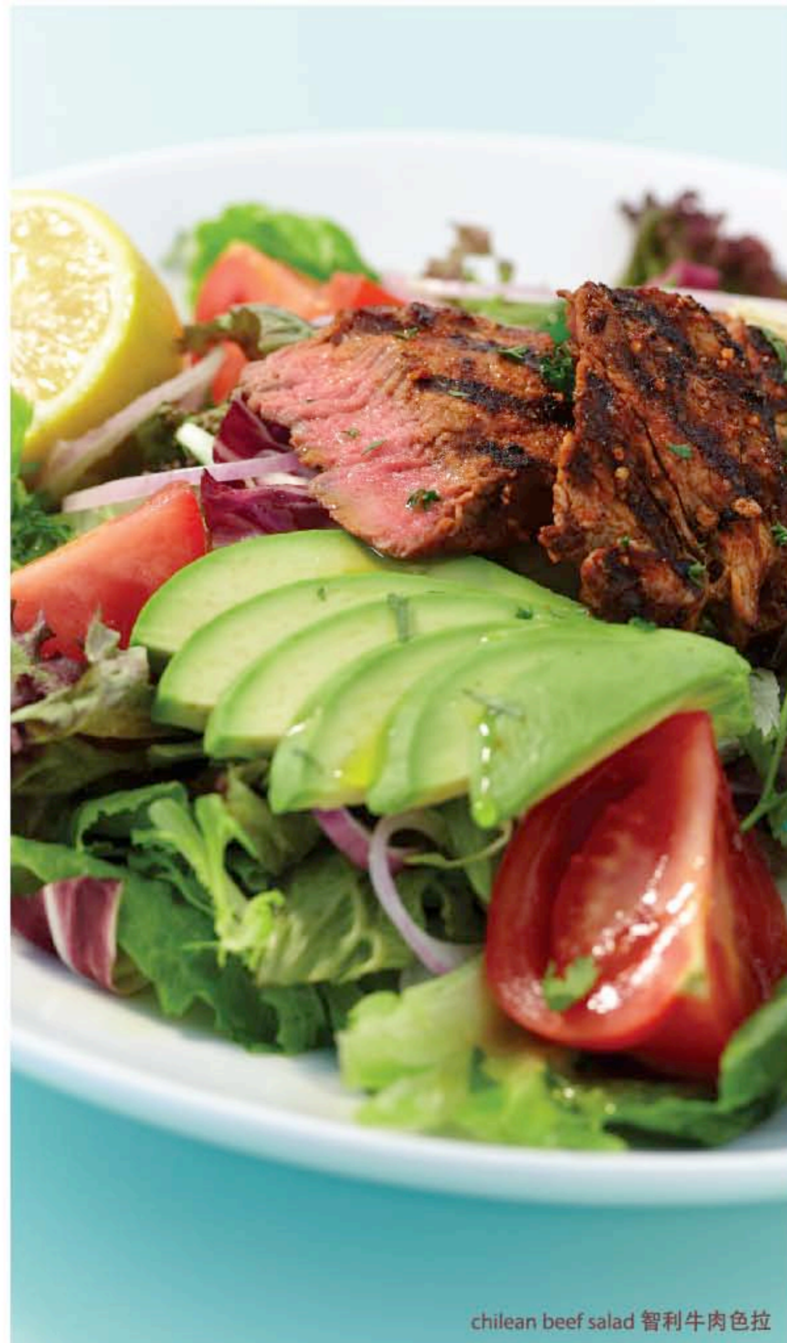
chilean beef salad 智利牛肉色拉