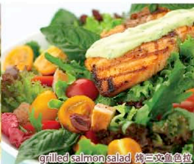
grilled salmon salad 烤三文鱼色拉