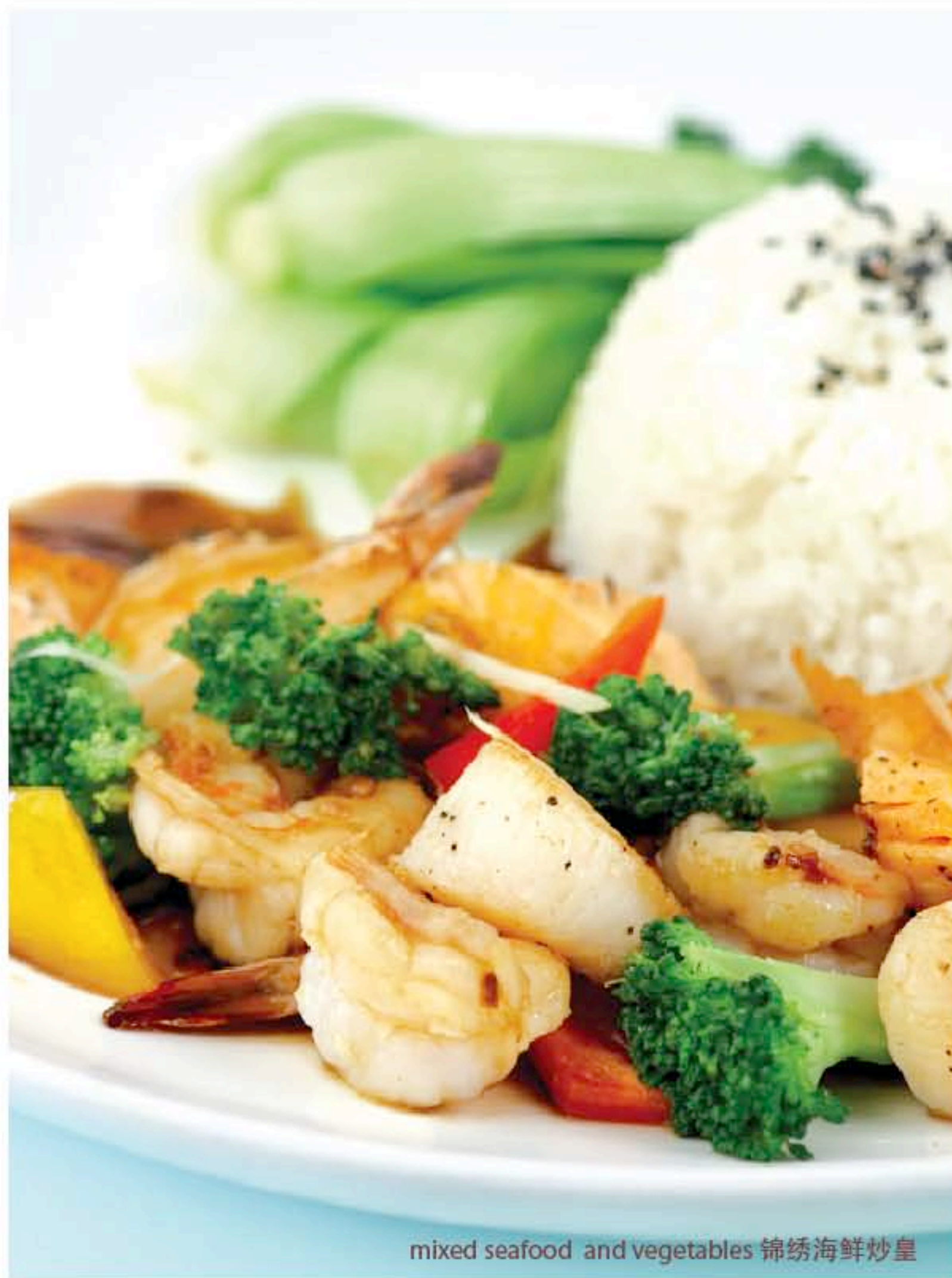
mixed seafood and vegetables 锦绣海鲜炒皇

homemade coconut-chili sauce stir-fried with shrimp and rice noodles, garnished with roasted peanuts, fresh bean sprouts, cilantro, and a wedge of lime 传统的越南式炒面，配上鲜虾，并佐以烤花生和新鲜豆芽、香菜、柠檬角 68