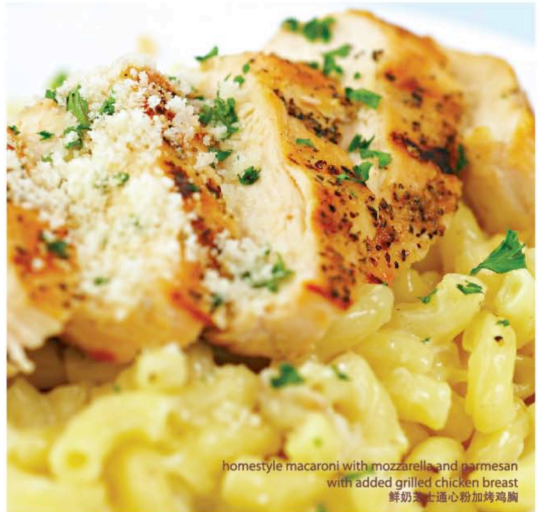
homestyle macaroni with mozzarella and parmesan with added grilled chicken breast 鲜奶芝士通心粉加烤鸡胸

a bowl of elbow macaroni with mozzarella and parmesan cheese, fresh cream, onion, and diced mushrooms, great with a grilled chicken breast for only 28 鲜奶油、蘑菇、巴马臣芝士、洋葱、莫占芝士制成的奶油味通心粉 62 若与烤鸡胸搭配更佳，仅加28元